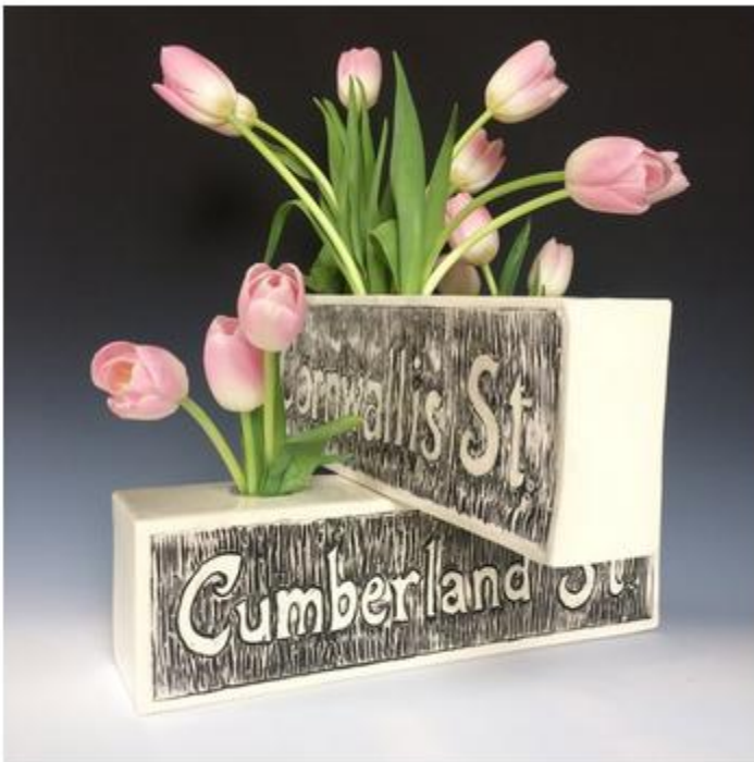
Street Sign Flower Brick