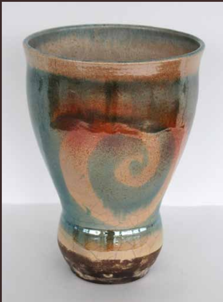
Open Vessel with Swirls, 9.75" x 7", ceramic