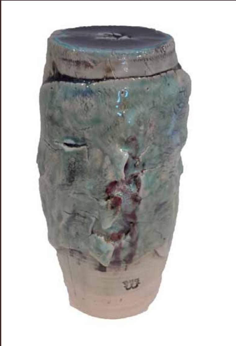
Stages series #1, 8" x 3", ceramic