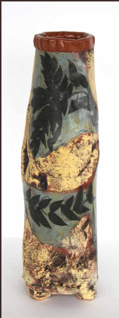
Vine Vase, 28 x 6 cm, ceramic