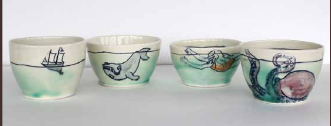
Under the sea set of four bowls, 2" x 2", ceramic