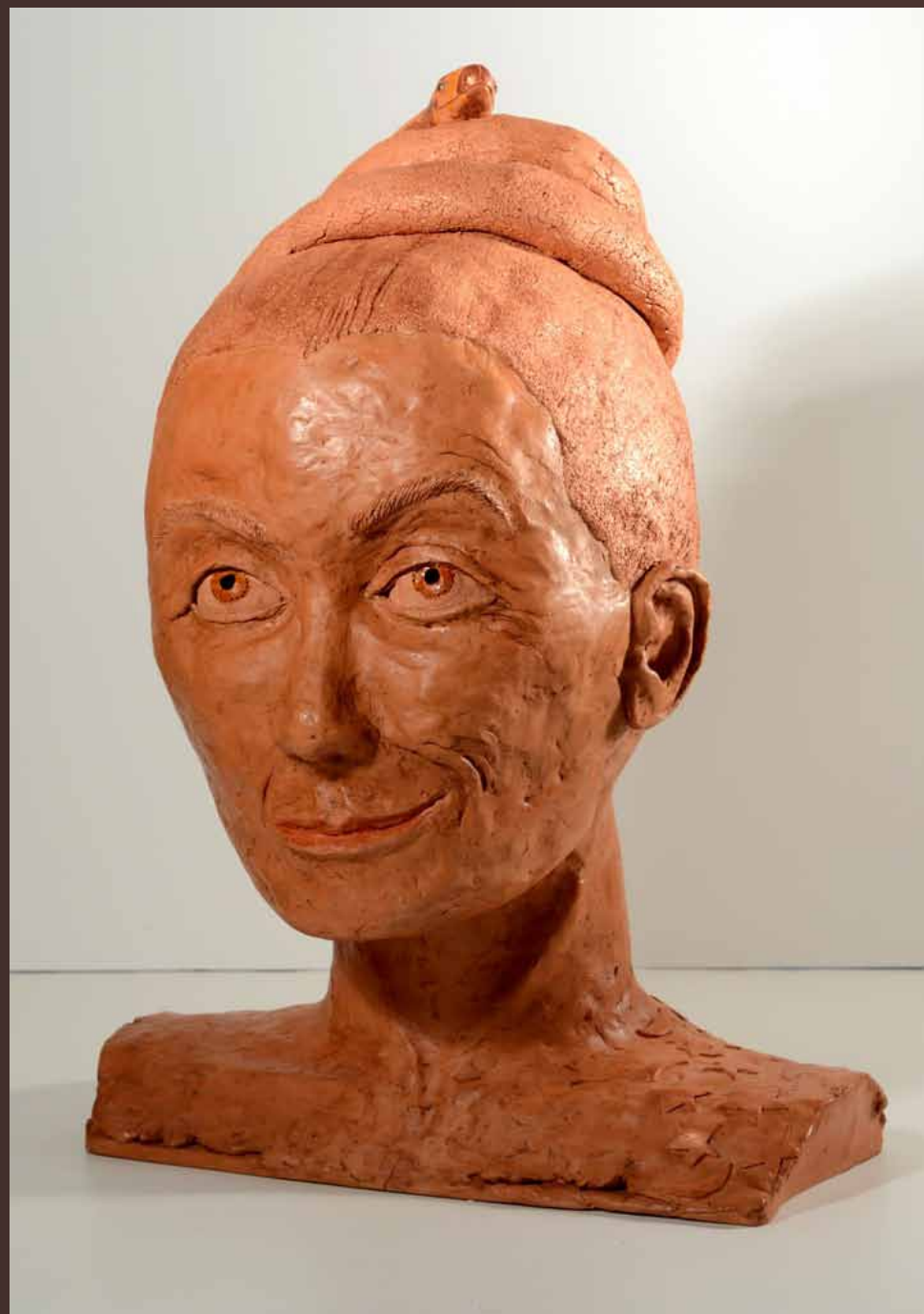
Wisewoman, 20" x 13", ceramic, wax, paint