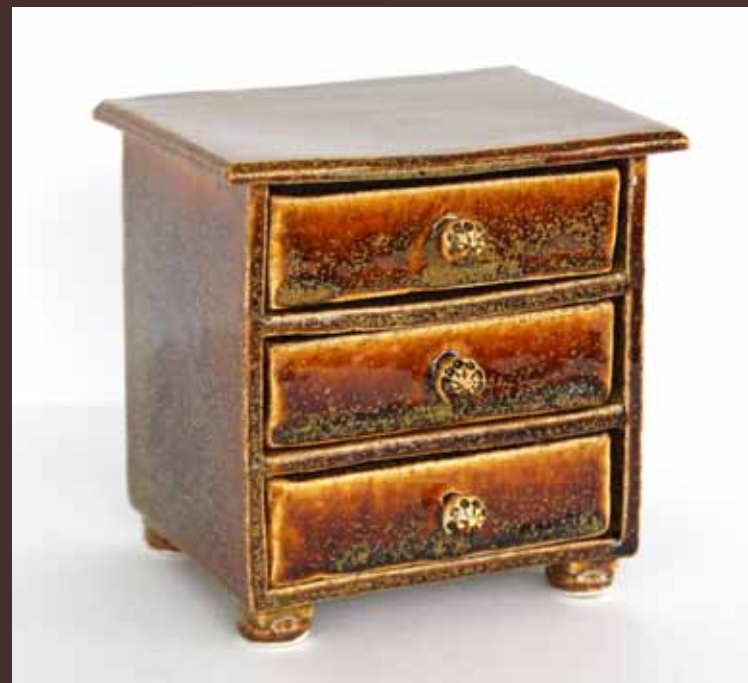
Chest of Drawers, 5" 3.75" x 5", ceramic