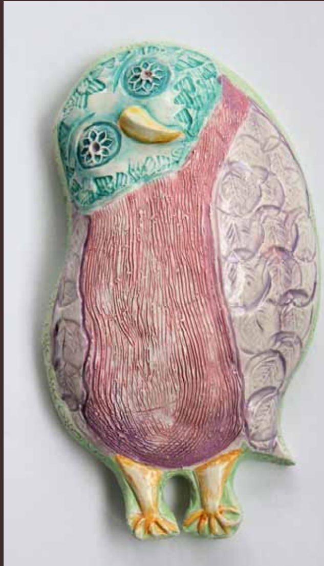
Owl (momma), 10.5" x 6" x 2.5", ceramic