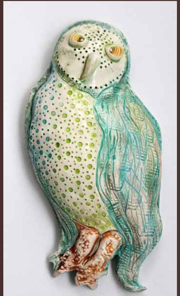
Owl (male), 12" x 6.5" x 2.5", ceramic