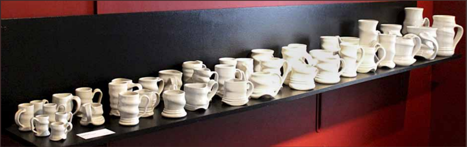
Mug Mania, 10.25" x 7" to 1.25" x 2", ceramic