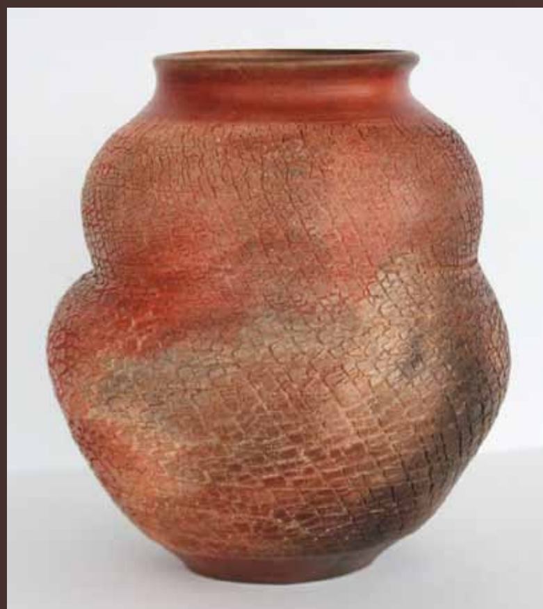
Medium Vase, Crackle Surface Smoke Fired, 15.5 × 13.5 cm, ceramic