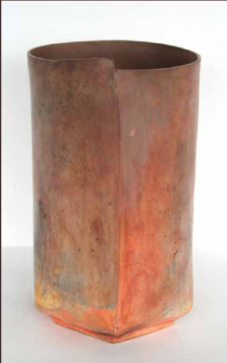
Smoke- Fired Vessel, 12" x 7", ceramic