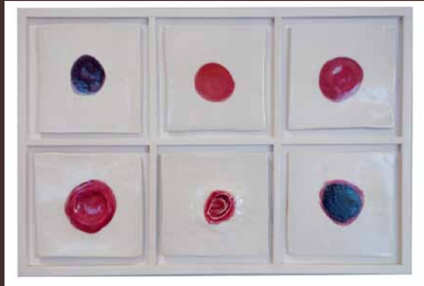
Stages Series, 13.25" x 19.75", ceramic, wood