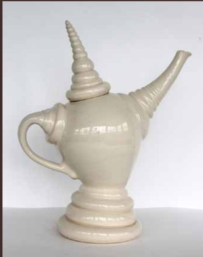
Vase = Middle Age, 14" x 7", ceramic