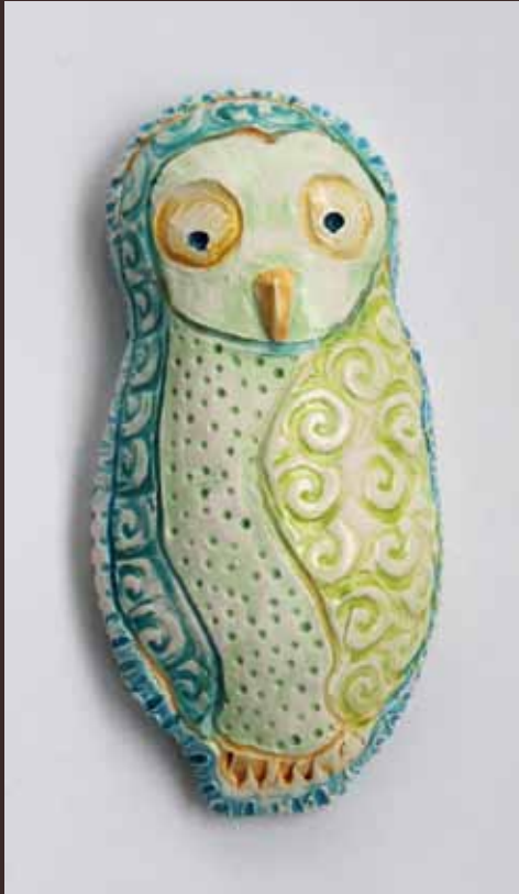
Owl (babe), 7" x 3.5" x 2", ceramic