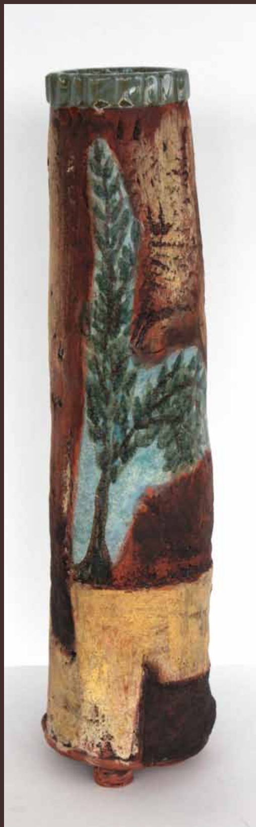
Tree Vase, 41 x 5 cm, ceramic