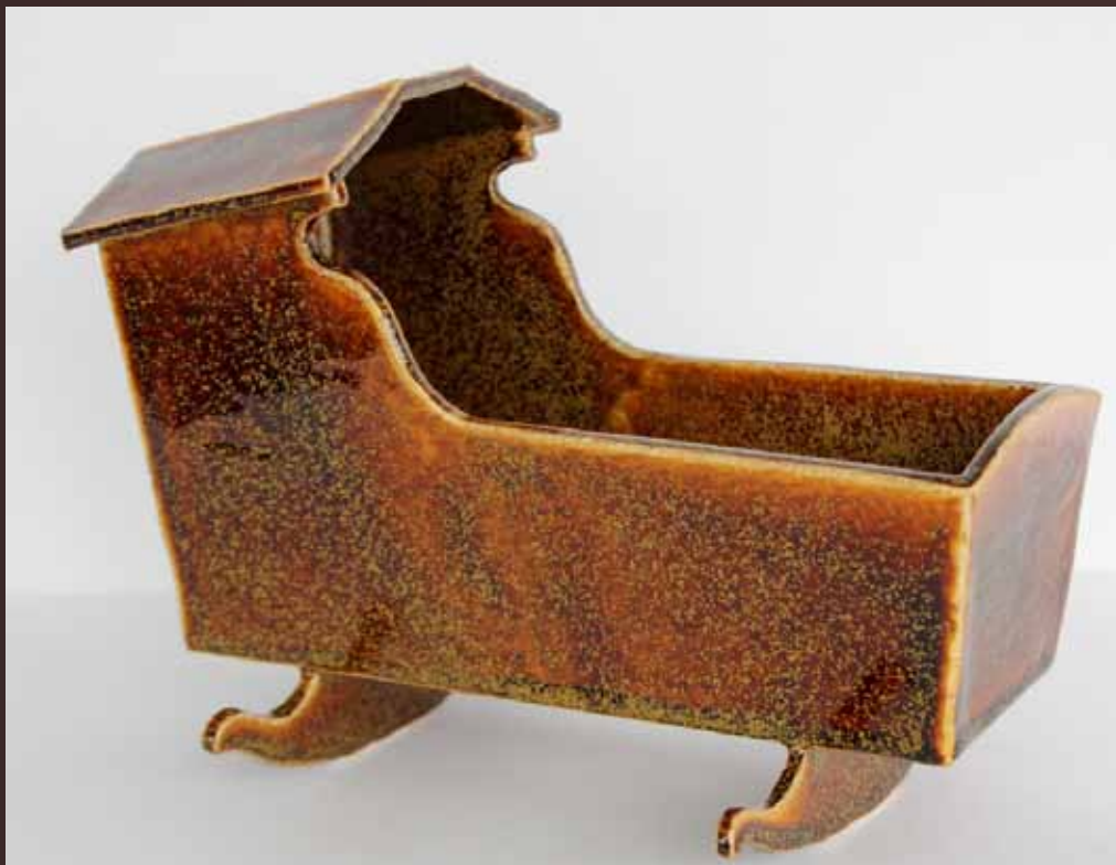
Cradle, 10" x 4.5" x 7", ceramic