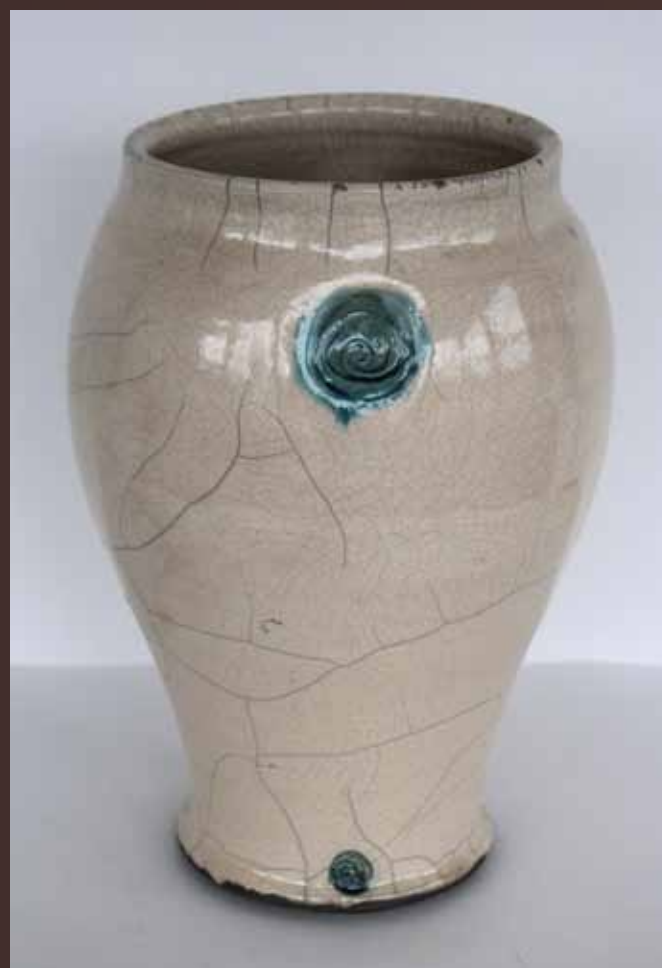
Vase with Swirly Stamps, 10.5" x 7.25", ceramic