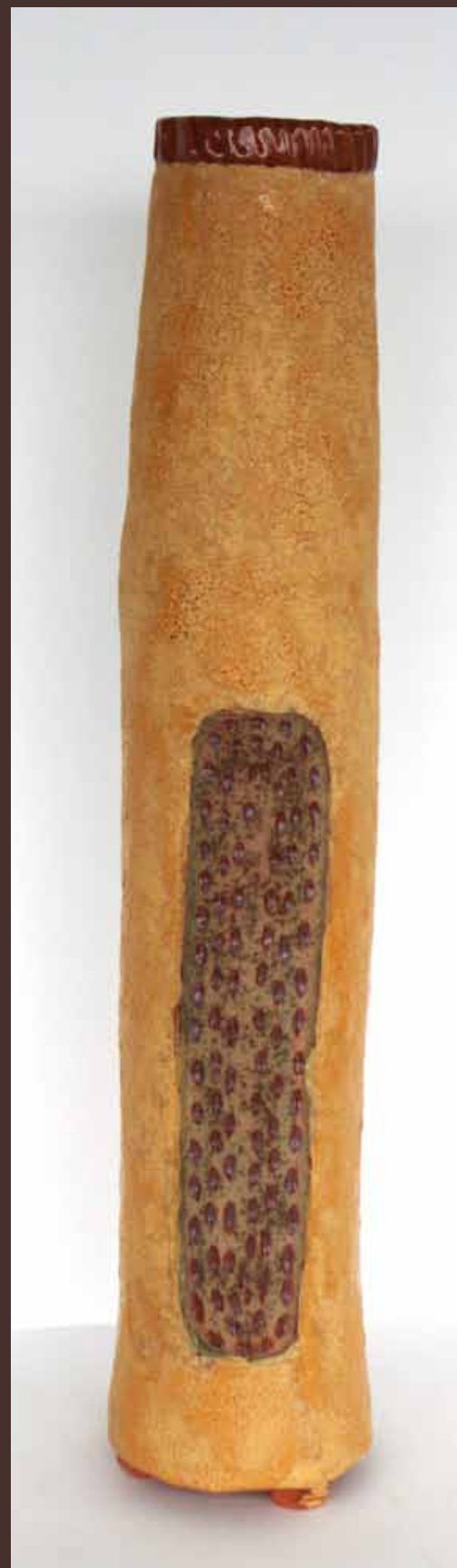
Yellow Vase, 50 x 6 cm, ceramic