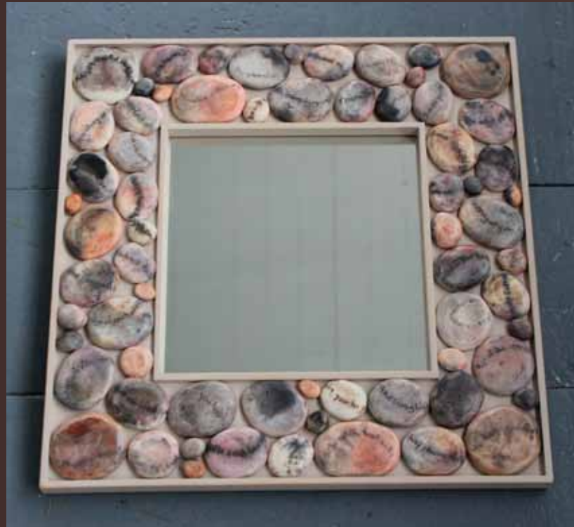
Beach walk reflection, 19" x 19", ceramic, mirror, wood