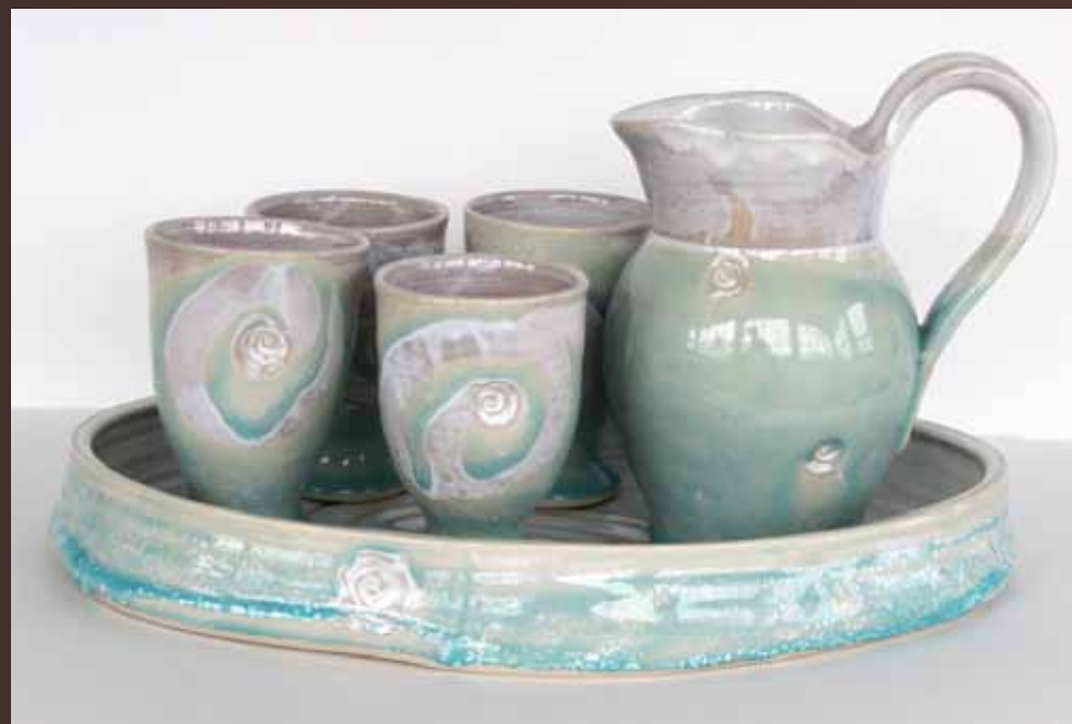
Sangria Swirl, 14" x 2", ceramic