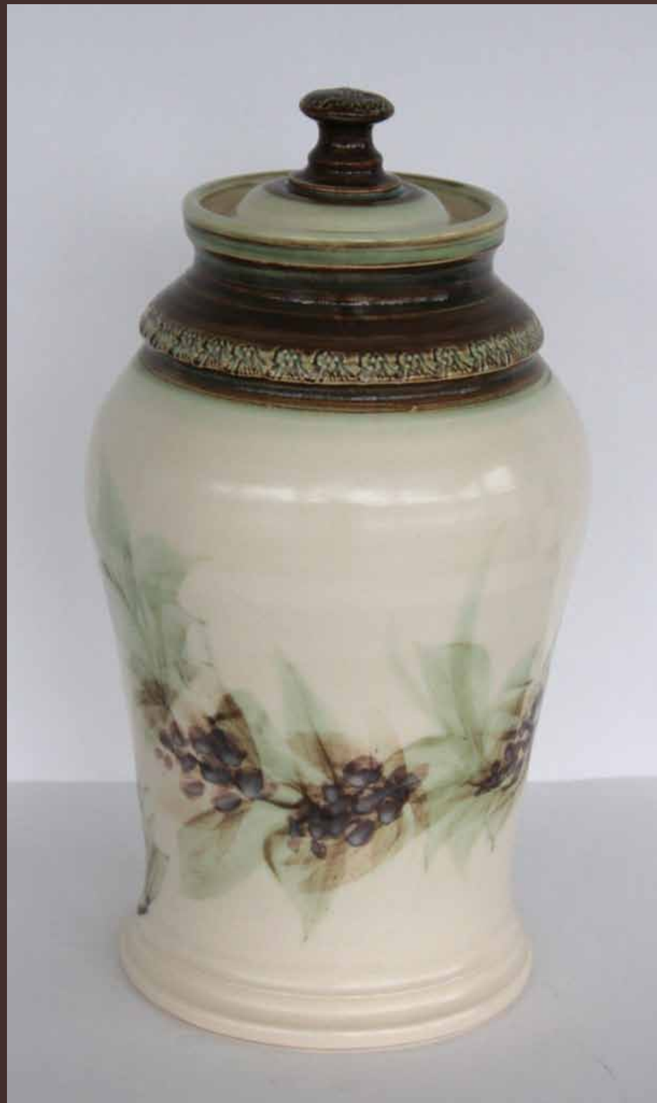
Green Urn, 12" x 6", ceramic