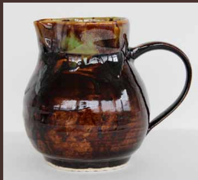
Jug, 6.5" x 4", ceramic