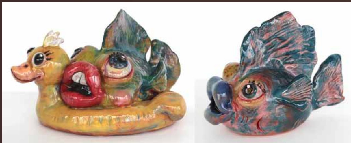
Rita, 12 × 15 cm, ceramic