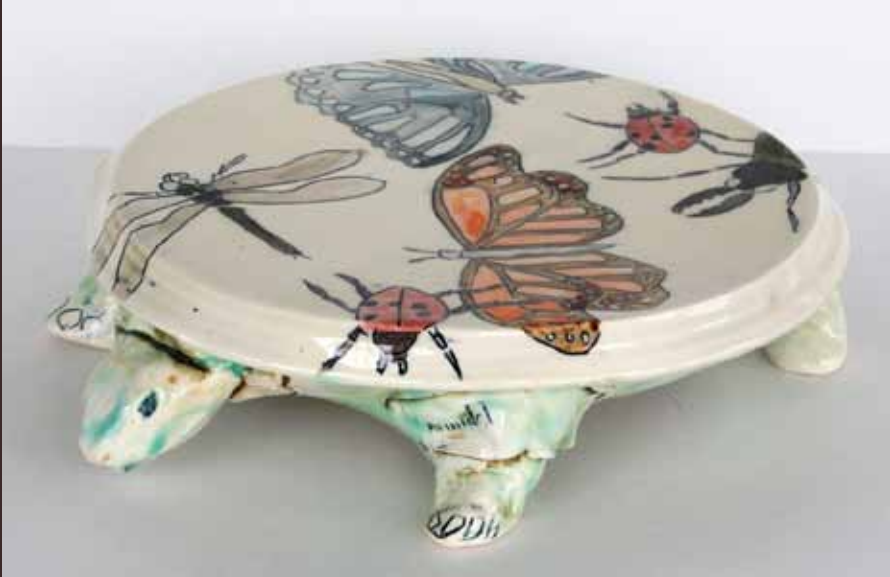
Turtle and insects cake stand, 2" x 12", ceramic