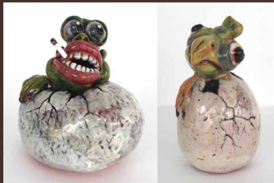
Aboo, 13 × 14 cm, ceramic