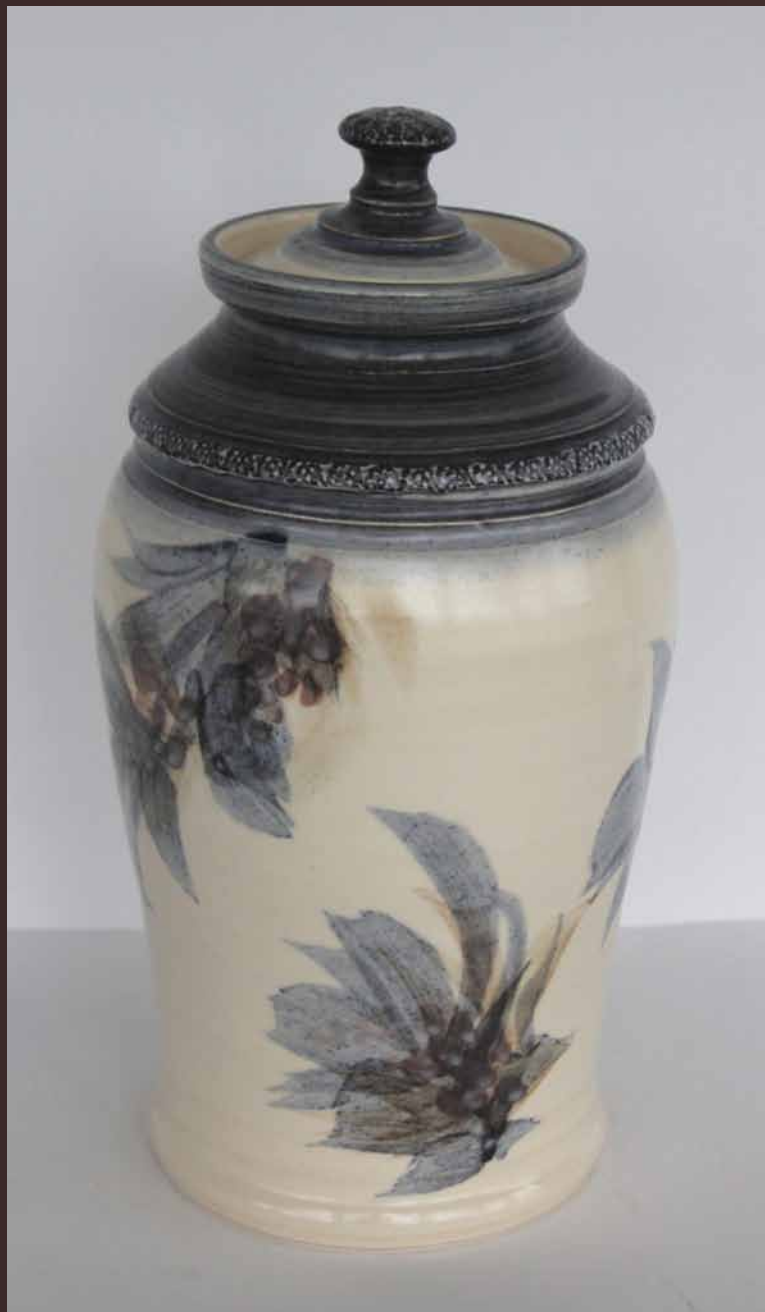
Blue Urn, 12" x 6", ceramic