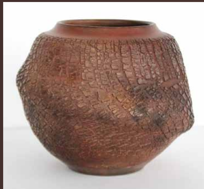
Small Vase, Crackle Surface Smoke Fired, 10.3 × 12.2 cm, ceramic