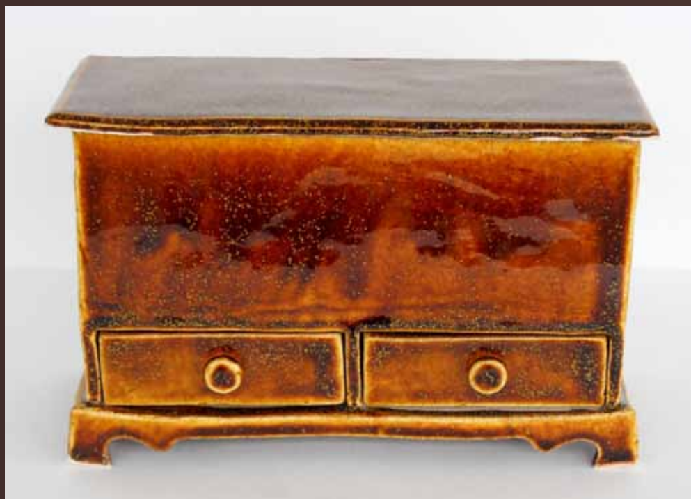
Storage Chest with Drawers, 8" x 4" x 6.5", ceramic