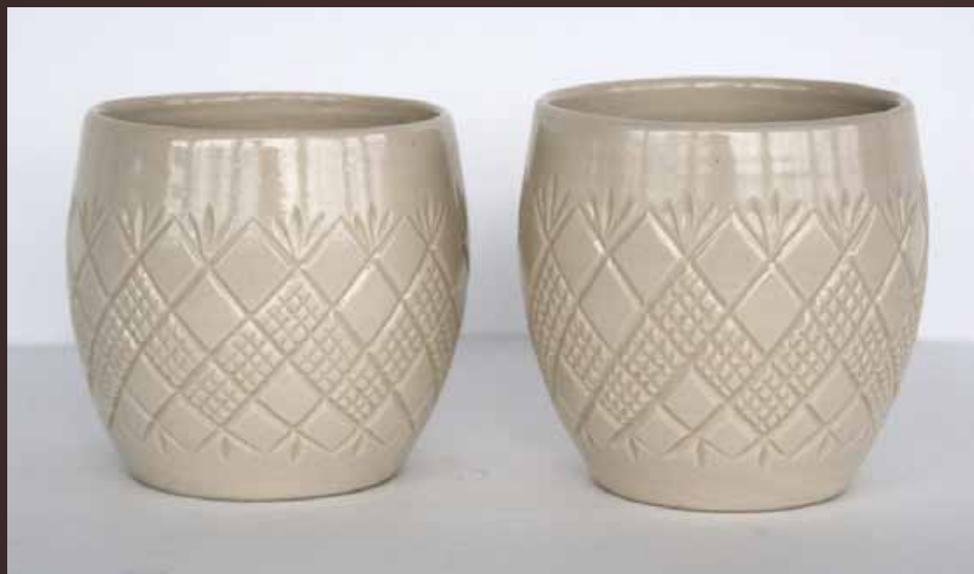
Stemless wine, 9 × 8 cm, ceramic