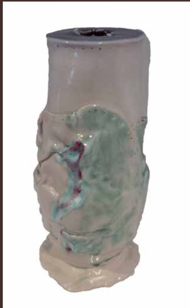
Stages series #2, 7.5" x 3.5", ceramic