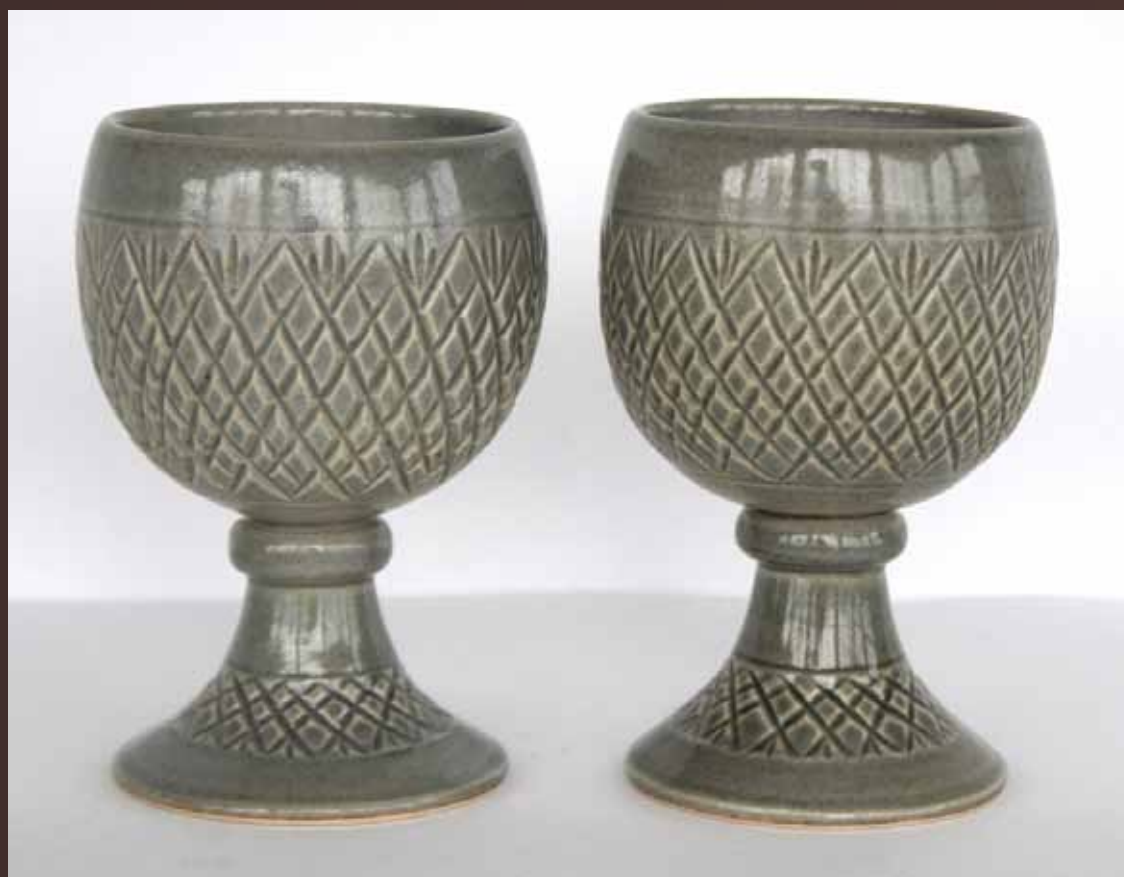
Wine, 12.5 × 7.5 cm, ceramic