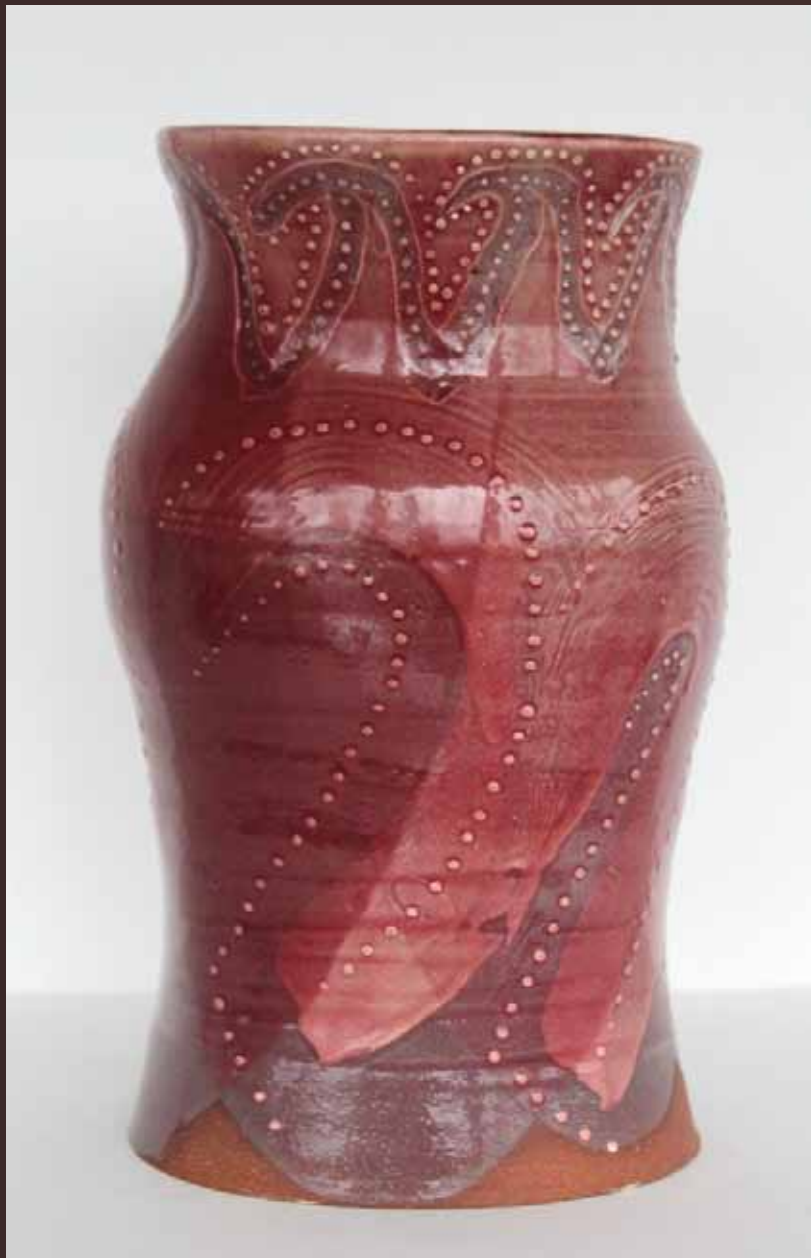
Waves, 11" x 5", ceramic