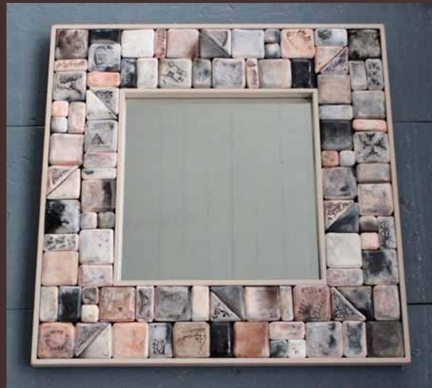
Smoke and mirrors, 20" x 20", ceramic, mirror, wood