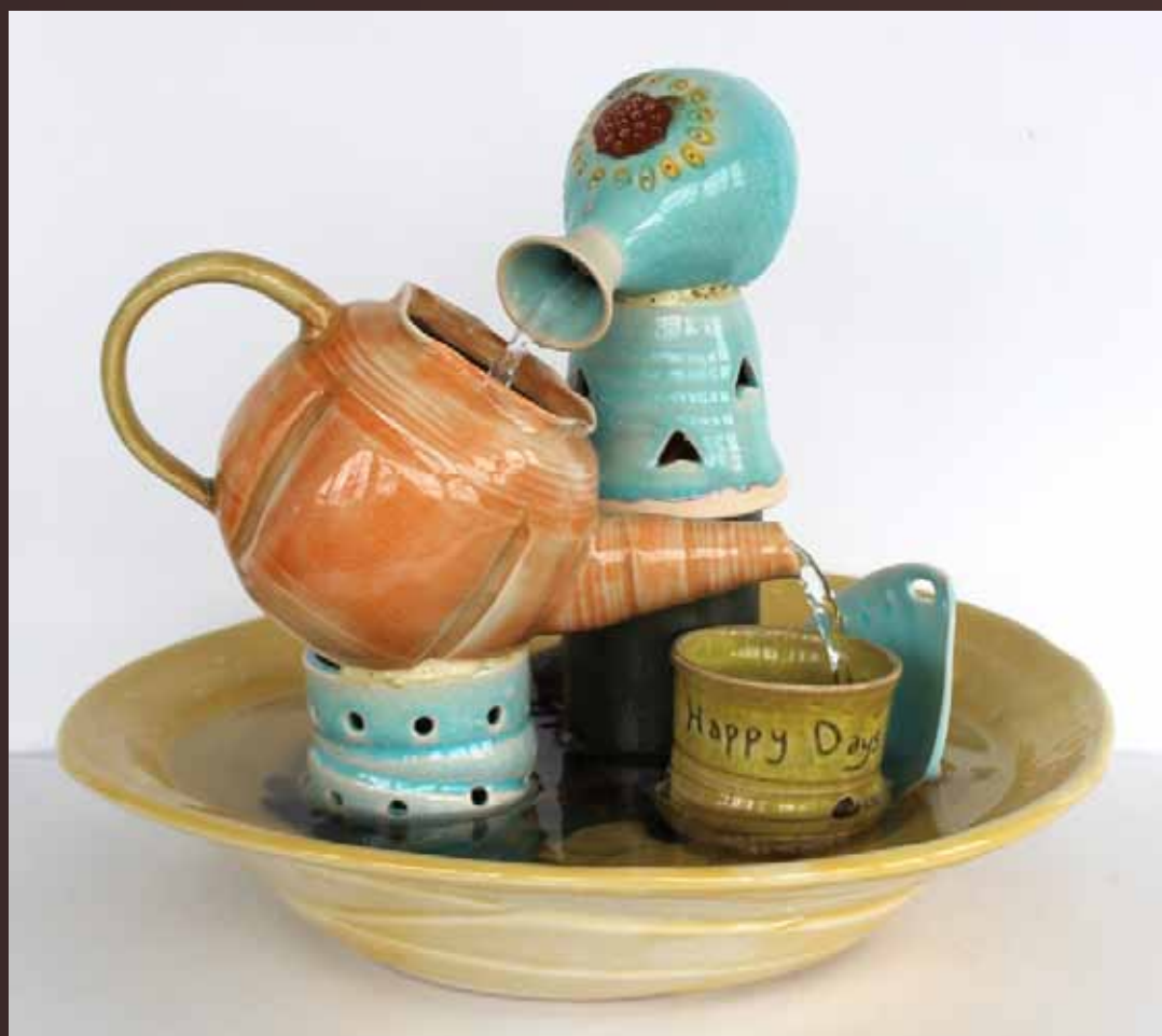
Happy Days, 13" x 12", ceramic, water pump