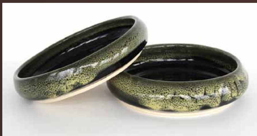
Black plant trays, 7", ceramic