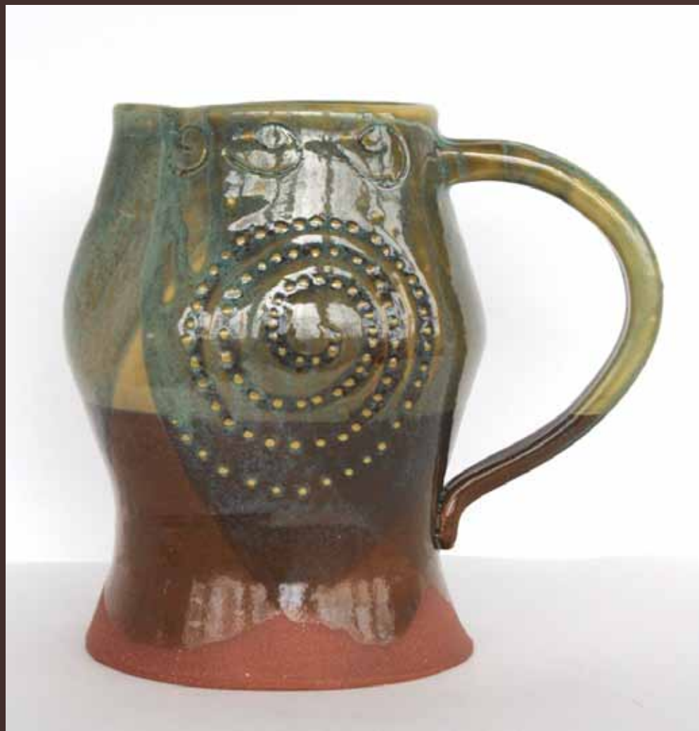
Spirals, 8" x 5", ceramic