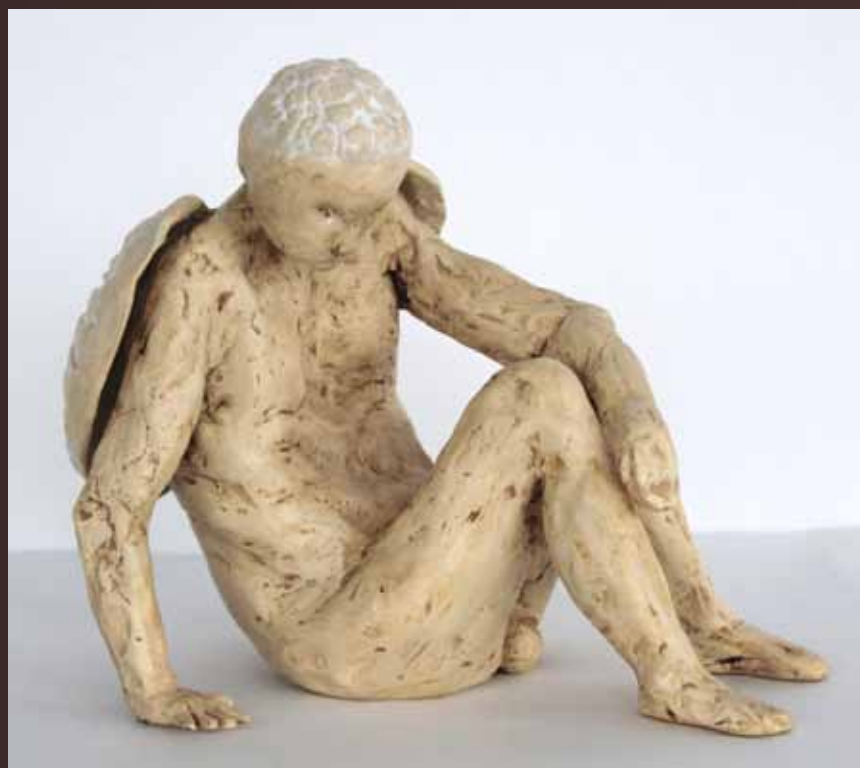
Think about it, 7" x 5" x 6", ceramic, paint