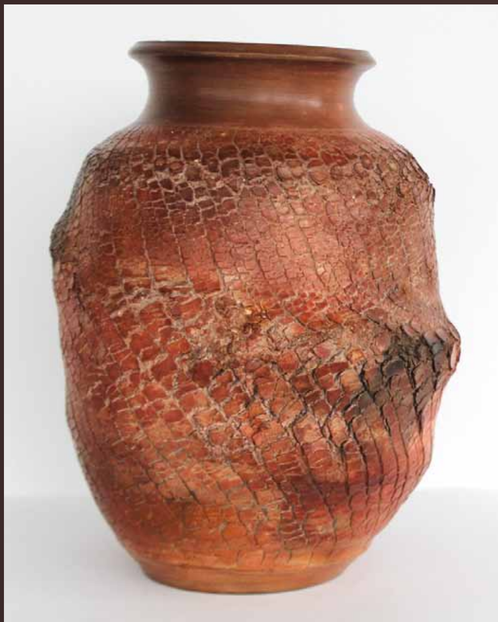
Large Vase, Crackle Surface Smoke Fired, 22 × 17.2 cm, ceramic