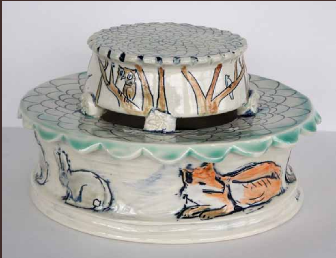
Forest cupcake stand, 11" x 12", ceramic