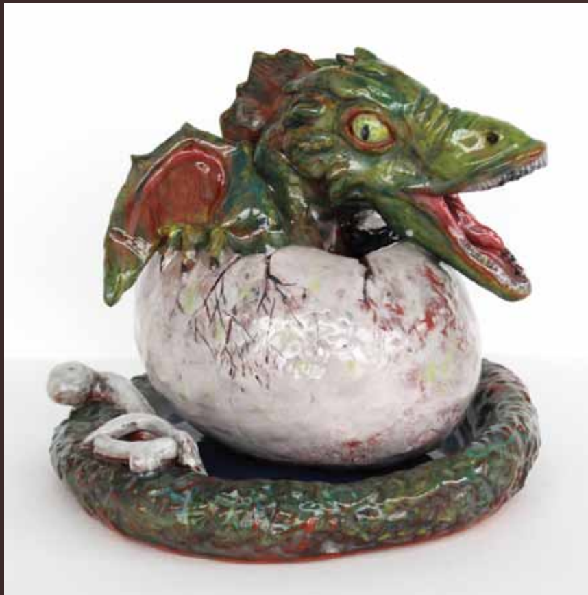
Khaleesi's Dragon and base, 17 × 20 cm, ceramic